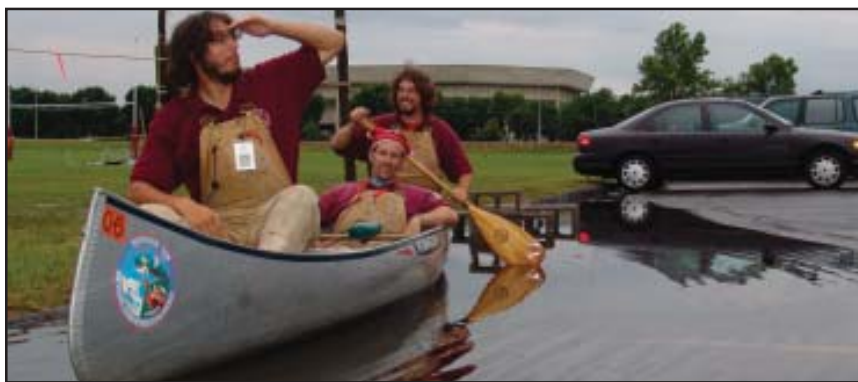
The OAWV staff can't pass up an opportunity to paddle their canoe, even if it's just in the parking lot at NOAC!