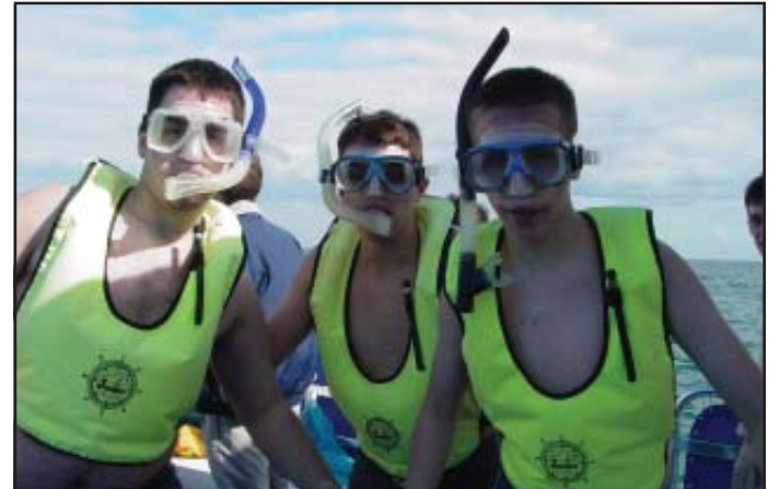
Three Arrowmen enjoy a snorkeling trip at Sea Base

The second project involves working with the