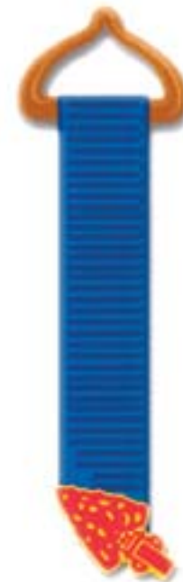
This blue ribbon with the Order's red arrowhead suspended at its bottom is the official recognition piece for the Leadership in Service Award.