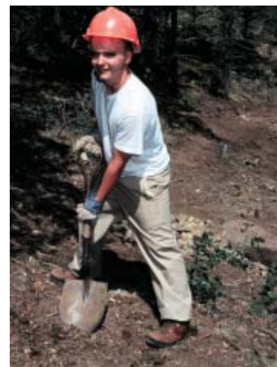
Arrowmen build new trails while in the backcountry.

More than 1,600 Arrowmen have contributed to the remarkable success of the OA Trail Crew program since its inception. The past 10 summers have produced more than 65,000 manhours of service, 100,000 feet of trail and the completion of five new trails. Reaching the tenth anniversary during the summer of 2004 demonstrated the Order's