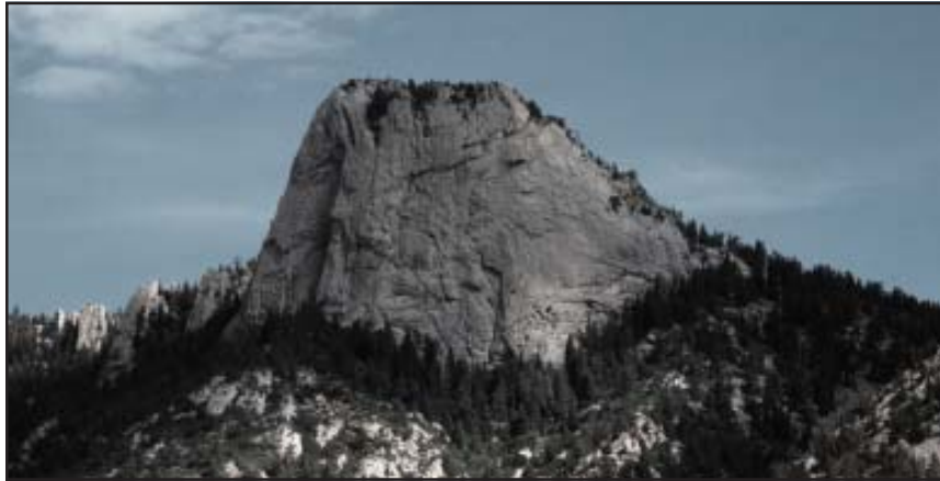
Philbreak is sponsored by Philmont Scout Ranch.