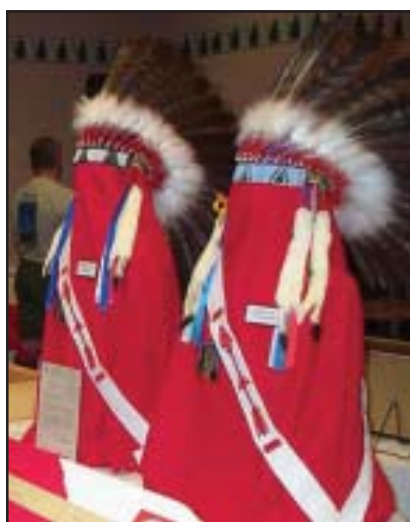
The museum displays OA history