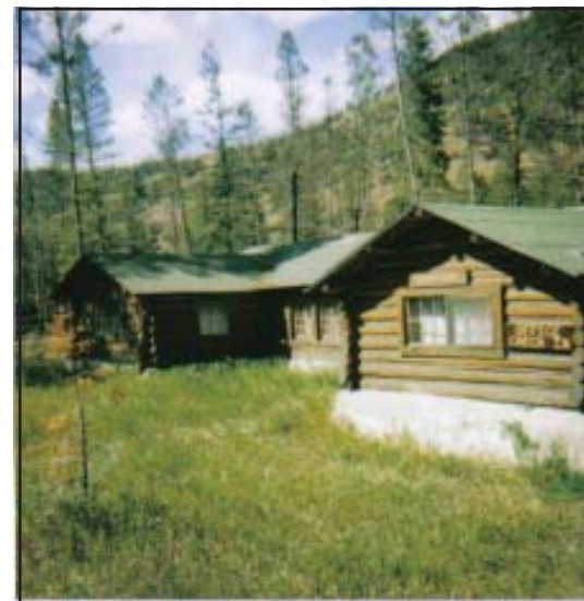
The project to restore the ranger cabin at Camp Buffalo Bill began in the fall of 2003 and was finished one year later with the help of an OA National Service Grant.

mission completed, the Arrowmen of Tatokainyanka Lodge look forward to future opportunities to provide service where ever it is needed. 🍀