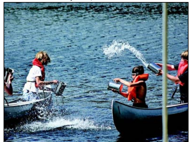
Among the many activities over the weekend Arrowmen were able to take part in water events.

These three section chiefs have been working hard to put on memorable conclaves. New and different ways of communicating and advertising their conclaves, along with incorporating exciting events and shows, have all lead to great ideas and anticipation for conclave.