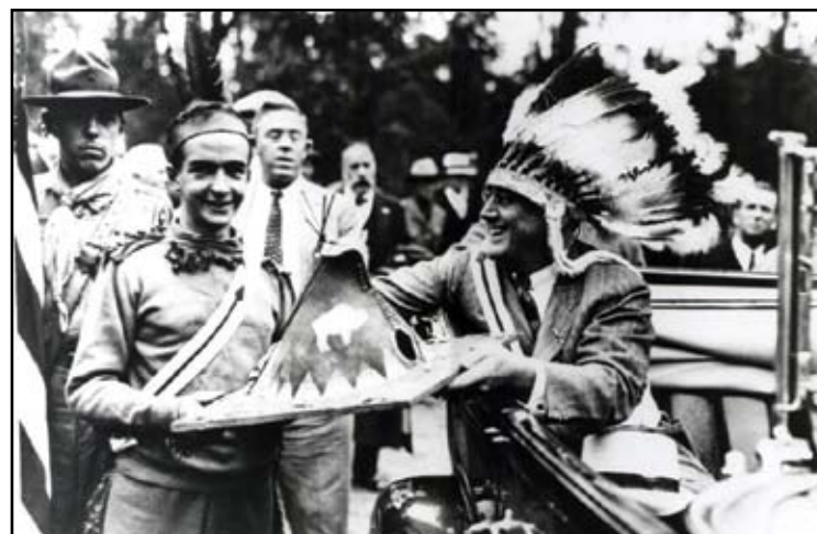
Franklin D. Roosevelt was inducted into the Order of the Arrow on August 23, 1933 in the Suanhacky Lodge part of the Greater New York Councils.

By no means has the complete history of each lodge been discussed in this article. There is a lot of information out there ready to be enjoyed. It is my hope that you look into the history of your lodge and of others. The legacy of those before us is truly important to learn about, and can inspire you to leave one of your own.