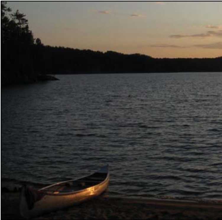
One of the many adventures Arrowmen can experience at OA High Adventure is a beautiful sunset up north with Wilderness Voyage or Canadian Odyssey.

Are you in need of some adventure this summer? Looking for a life changing experience? Do you have two weeks with nothing to do? If you answered yes, to all three questions, then OA High Adventure is the perfect opportunity for you! The OA High Adventure programs are some of the most exciting programs in our Order, and they teach many valuable lessons.