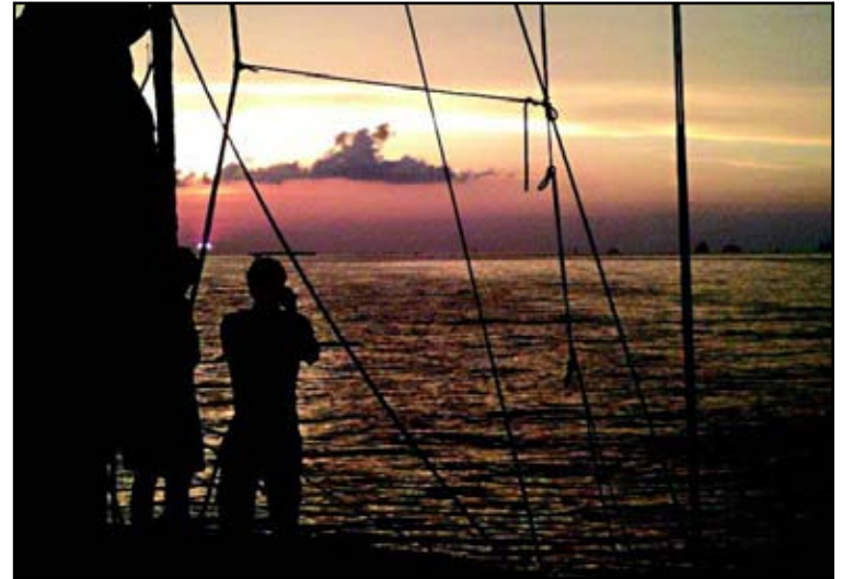
Arrowmen with the OA Ocean Adventure enjoy one of the many great views while sailing in the Florida Keys.

To sign up for your adventure, go to http://adventure.oa-bsa.org . Spots are quickly filling up! If you wait for another week or two, you may miss out! Sign up now while treks are still available.